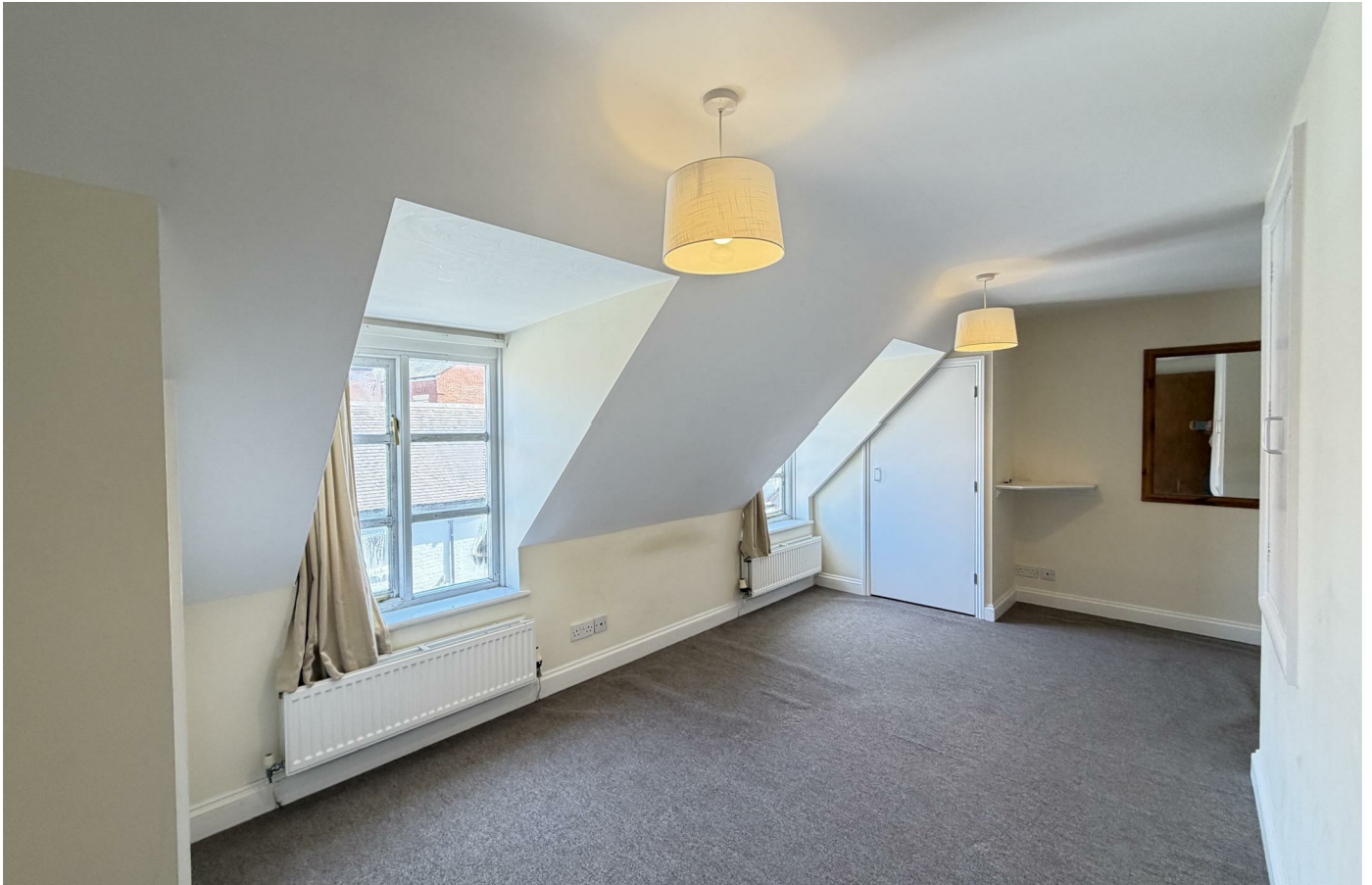
The Bakery 1 Crompton Street, Warwick, CV34 6HJ